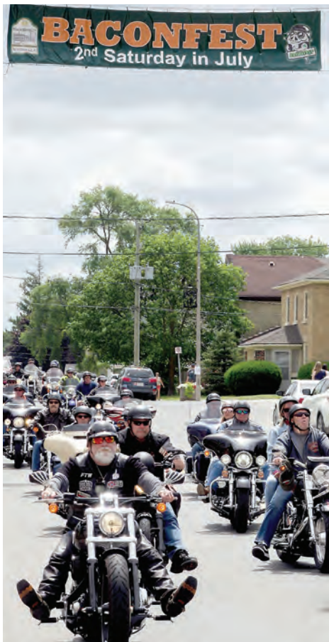
Lucan, Ontario welcomes all to Baconfest on Saturday, July 14th.

There’s a roar louder than thunder and lots of leathers as the streets of Lucan, Ontario fill up with motorcycles and Bacon lovers of every kind. They rumble alone, in pairs and in packs, to park, stretch their legs and take it all in.